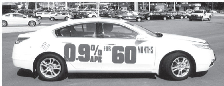
2010 Acura TL....Waiting On You To Buy!

Big Sale On New 2010 Acura Interest Rate As Low As 0.9 to 1.9% While They Last Certified Pre-Owned Vehicles As Low As $19,990